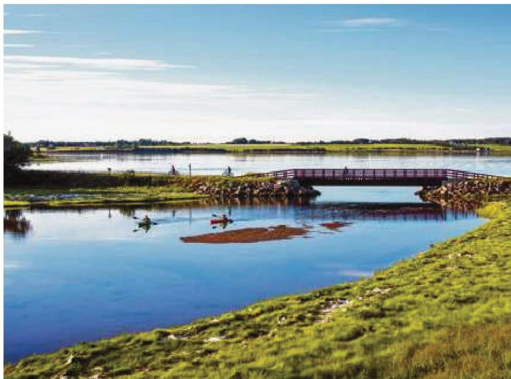
TOURISM PRINCE EDWARD ISLAND

Visitors are required to submit a travel form within 30 days of their expected travel date and follow public health guidelines during their stay. Ful-